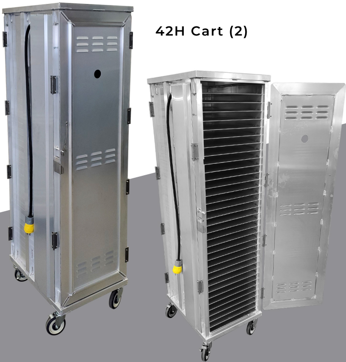
42H Cart (2)