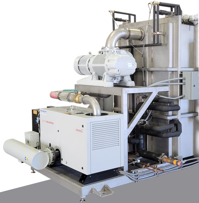
Leybold Dry Screw Pump and Booster